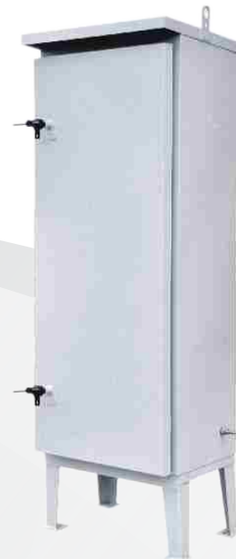
Outdoor Control & Relay Panel