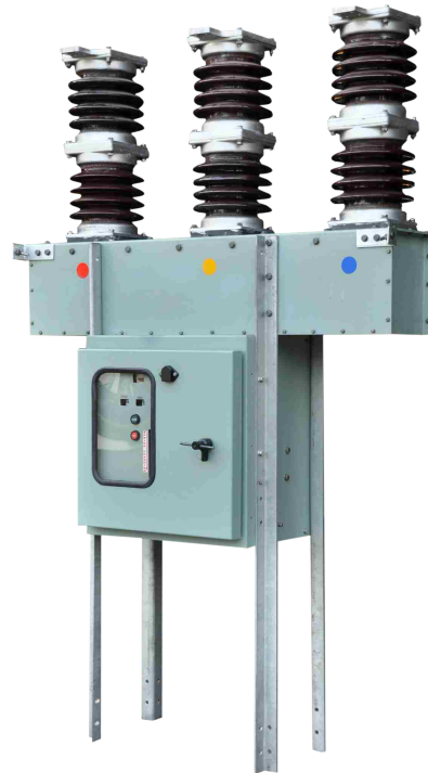
12 kV Outdoor PC VCB