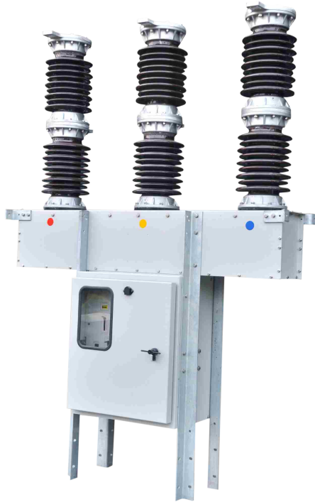
36 kV Outdoor PC VCB